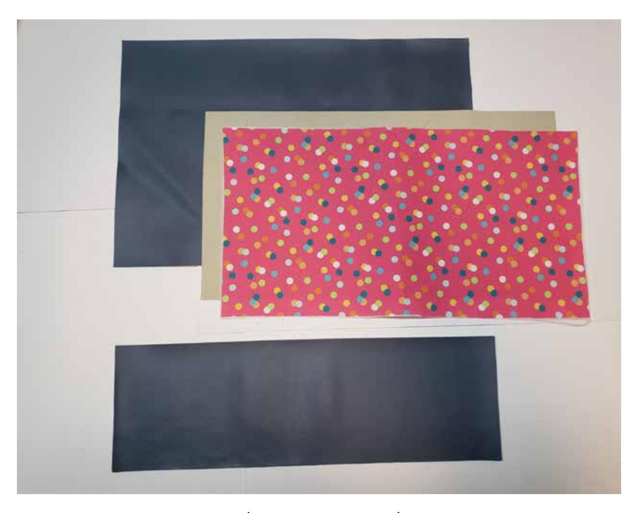
Back outer panel