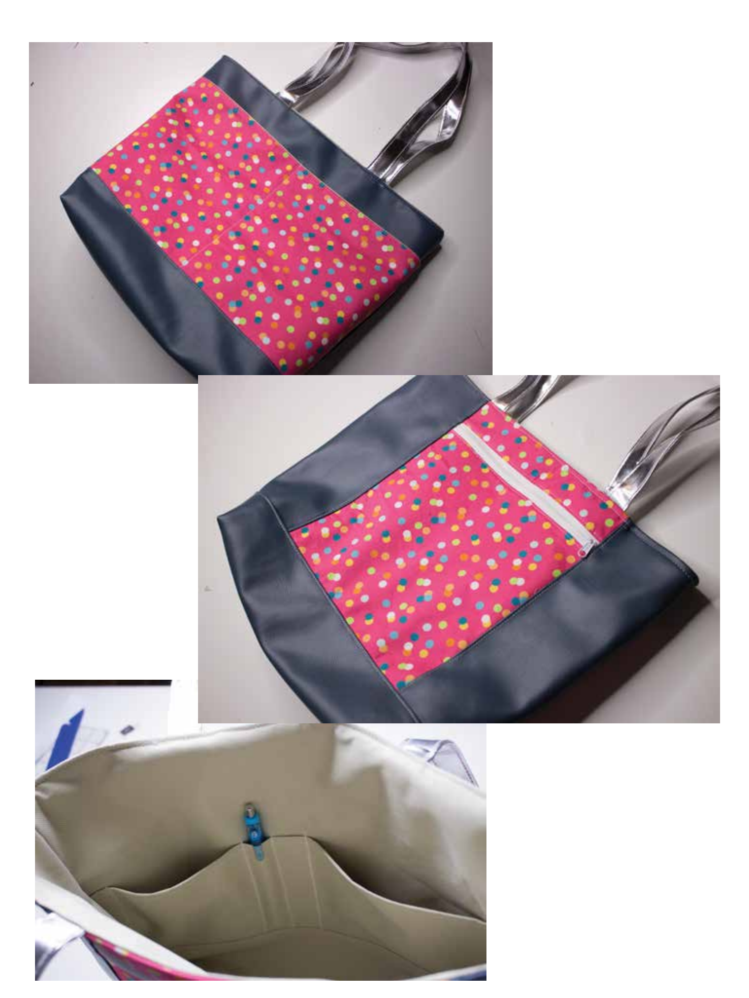
Charmed by Ashey Copyright 2020