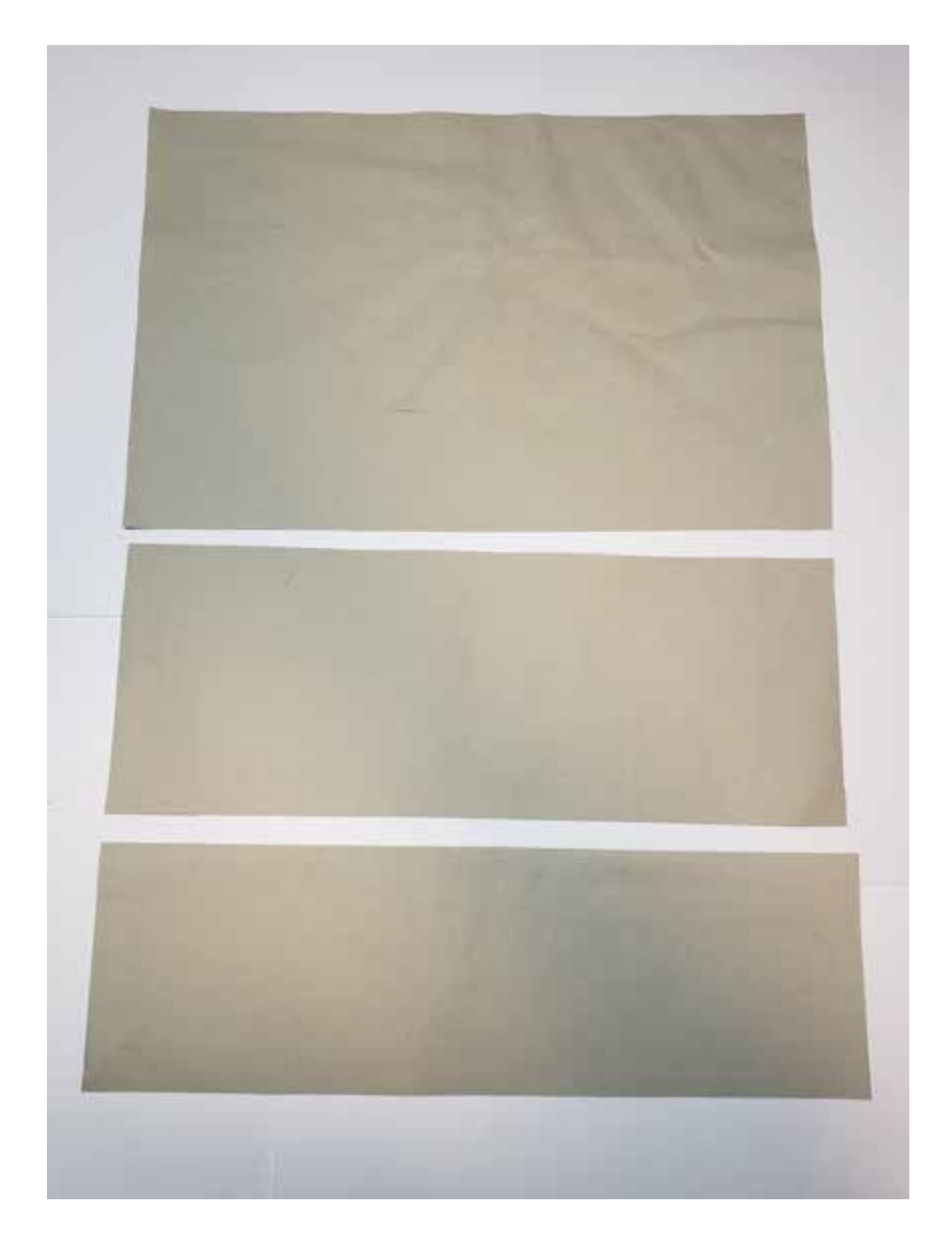
Lining pocket panel