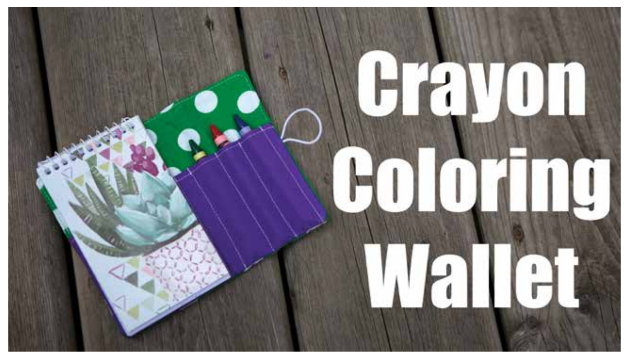
First off Thank you! for downloading this FREE pattern!

Before we get started i would love it if you checked out the Video tutorial for this pattern if you havnt already, Subscribe to the channel and Share on Instagram if you do make this!