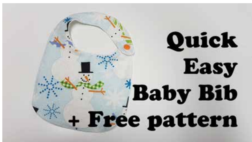
Quick Easy Baby Bib + Free pattern