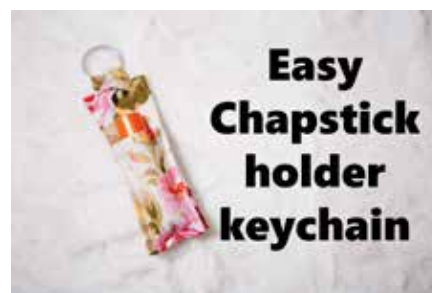
Easy Chapstick holder keychain