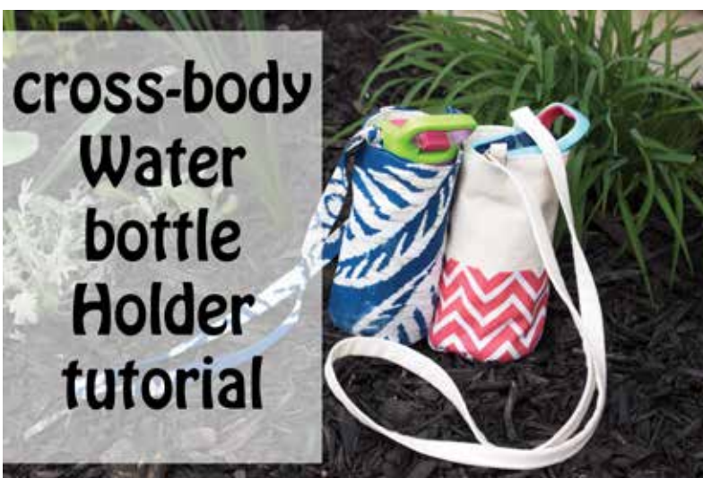
cross-body Water bottle Holder tutorial