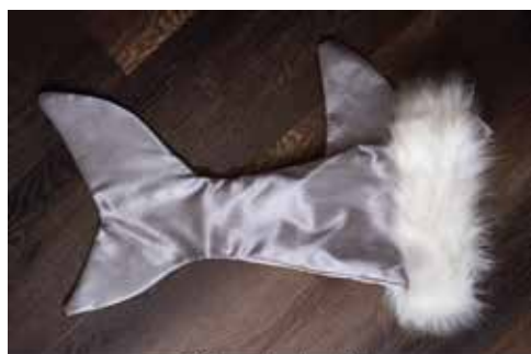
Shark Tail Stocking pattern